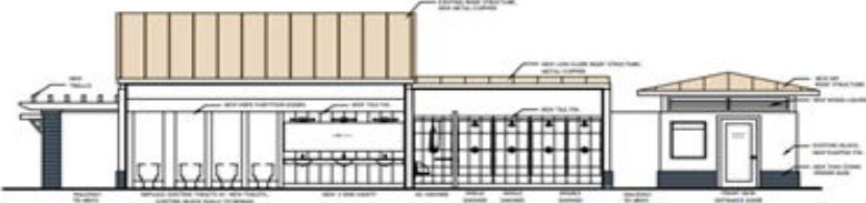
⊕ WOMEN'S BATHROOM