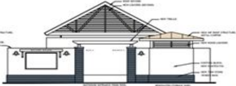
⊕ POOL ENTRANCE ELEVATION