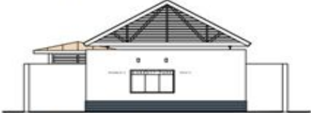
⊕ MAIN BATHHOUSE WALL ELEVATION