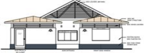
⊕ MAIN ENTRANCE ELEVATION